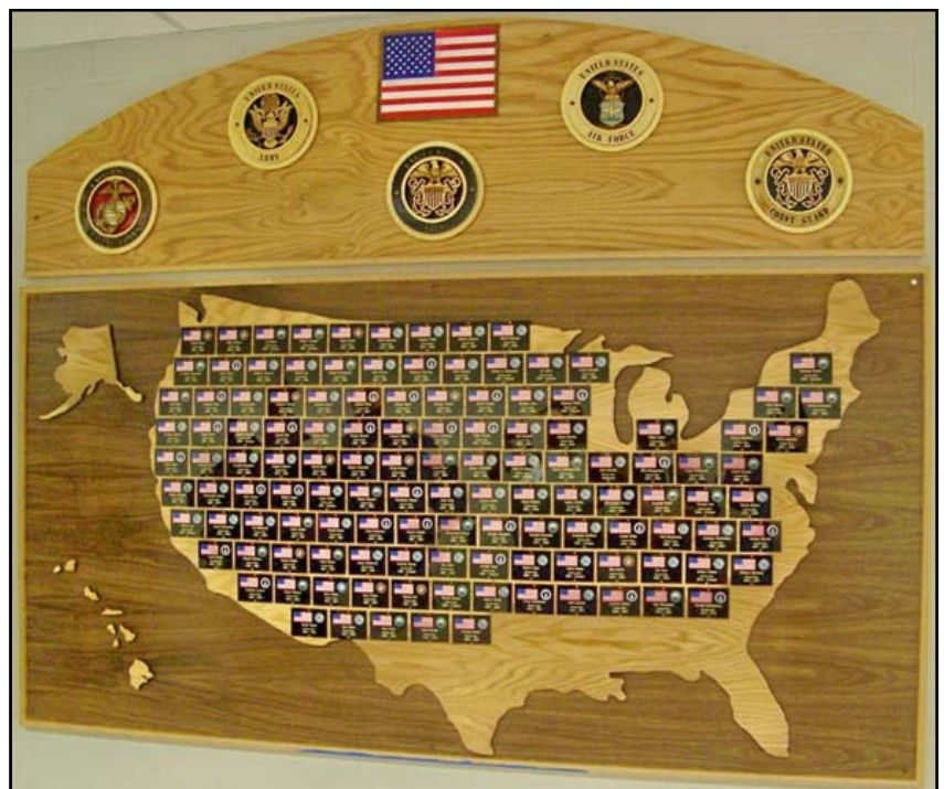
The Plaque at Snake River Correctional Institution